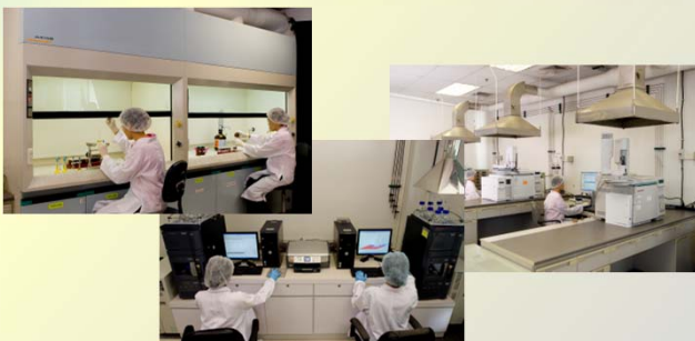
Figure 1 : Determination of active ingredients by GC and HPLC